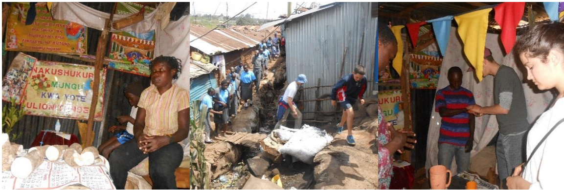
Fig 1: A family we recently helped a child Fig 2: Visitors walking in Kibera Fig 3: Visitors praying with a family in Kibera