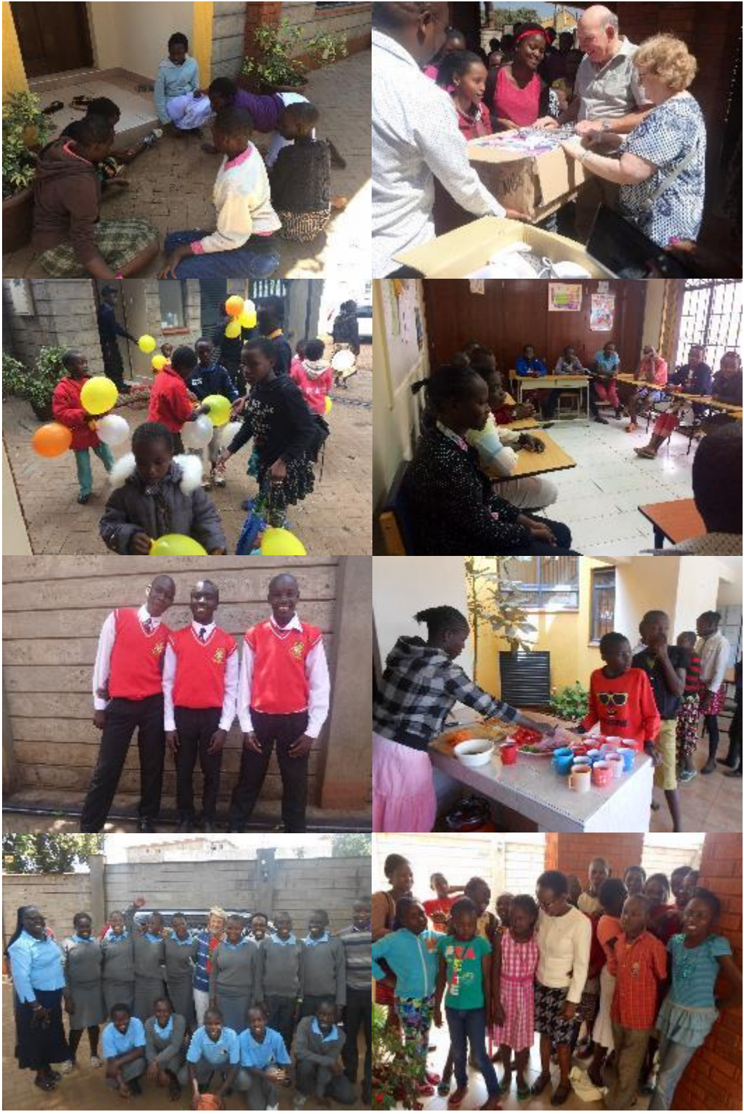
Images from the WkW Centre 2016-17