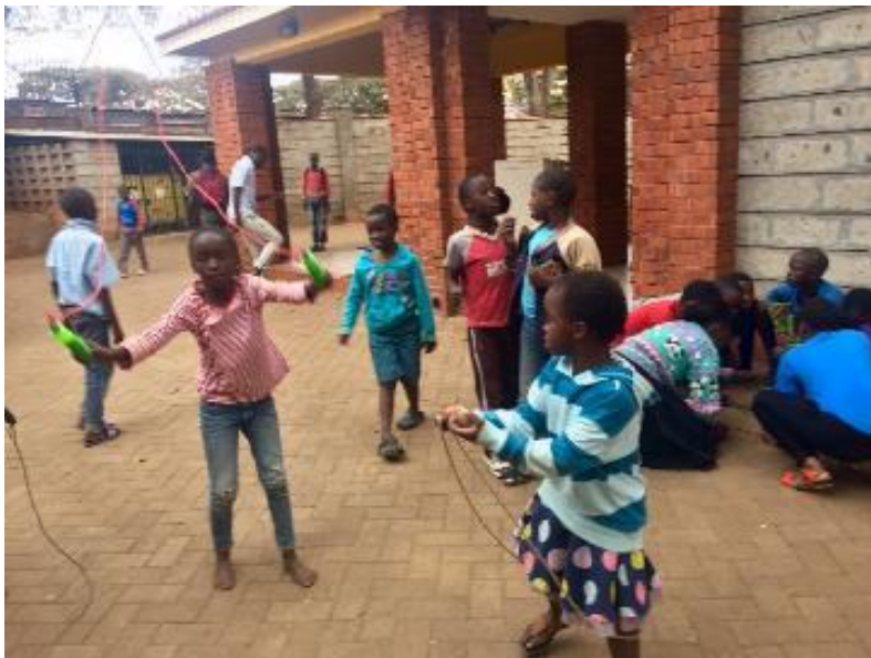
Figure 2: Children playing in safety at the WKW Centre

In other words, our aim is to help provide many of the things that most of us take for granted: education, the ability to work, a support group of friends and family – simple rights that no human should ever have to be without.